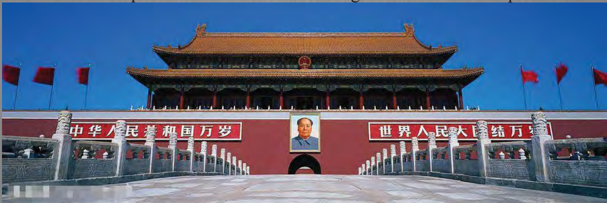
Landmark of Beijing—TianAnmen Square

Beijing, also known as Peking, is the capital of the People's Republic of China and one of the most populous cities in the world, with a population of estimated 20 million. The city is the country's political, cultural, and educational center, and home to the headquarters for most of China's largest state-owned companies.