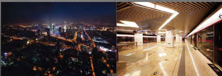
The transportation of Beijing

Governed as a municipality under the direct administration of the national government, Beijing is divided into 14 urban and suburban districts. It is a major transportation hub, with dozens of railways, roads and motorways passing through the city, and the destination of many international flights to China.