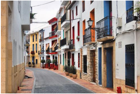
Street in La Nucía

La Nucía is located in a fruit valley between Benidorm and Callosa d'En Sarrià, 3 km from the coast of Altea. The urban center is on a promontory overlooking the Mediterranean Sea, 51 km north of Alicante Airport and 8 km north of Benidorm. Population (with over 80 different nationalities, mainly europeans) are 17.000 citizens.